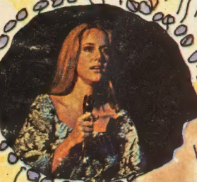
"Fragile as crystals of glass"